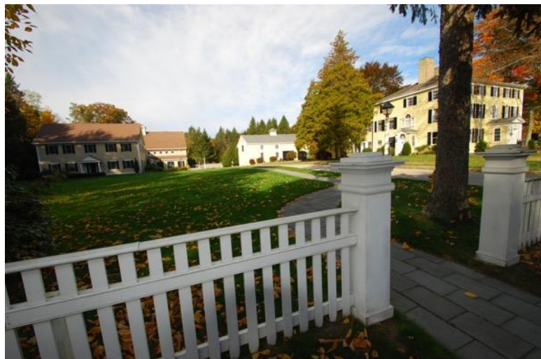
Ministry Center, The Barn, Wigglesworth-Cutler House

Church building Wigglesworth-Cutler House Ministry Center The Barn Mission House Parking Lot