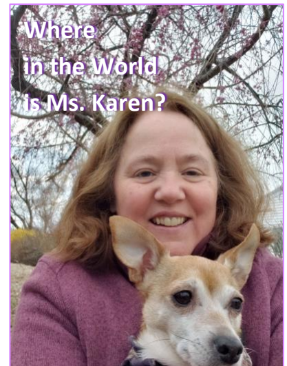
I took a walk with my dog, Tater. She and I are in front of my favorite tree when we got home.

Show your child the ball and say, "This ball has a happy face on it" .... or if there's no face on the ball, bounce it and say, "This ball is bouncy because it's happy." Say, "You can be happy because Jesus loves you! And Jesus loves me! Let's toss the happy ball into the basket." As your child tosses the ball into the basket remind them how happy they can be because Jesus loves them. When they toss the ball into the basket have them say, "Jesus Loves Me!"